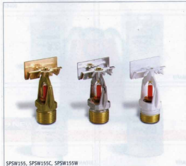
SPSW155, SPSW155C, SPSW155W